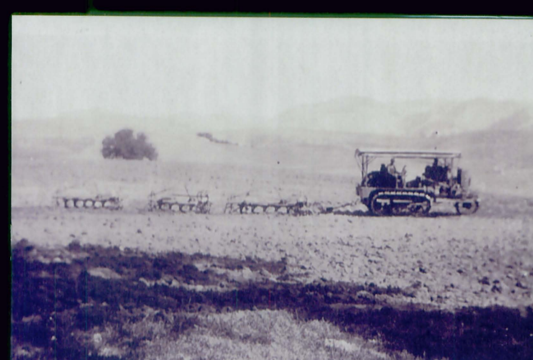
Working Ground in Kirk Canyon