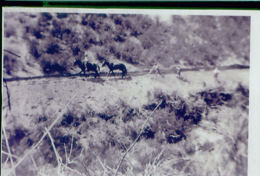
Building a Road to Robinson Canyon Canyon