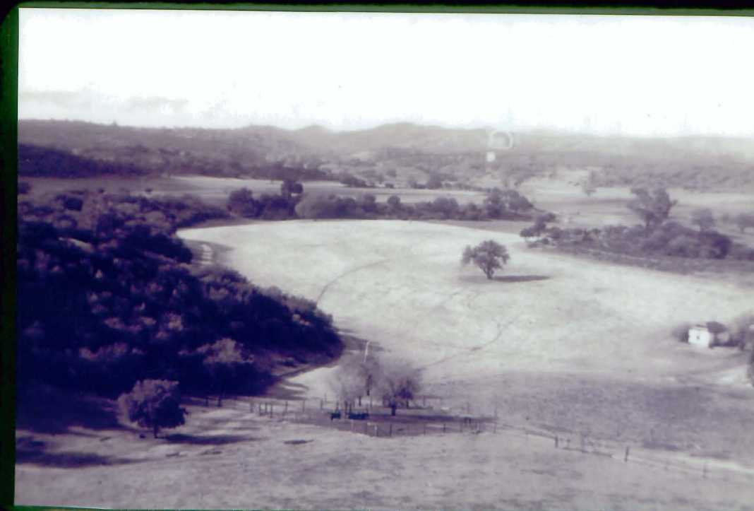
Old Adobe House on Argyle