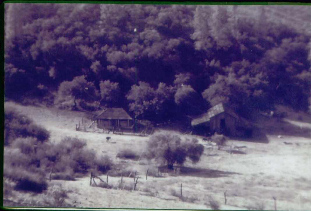
Old Homestead on Argyle