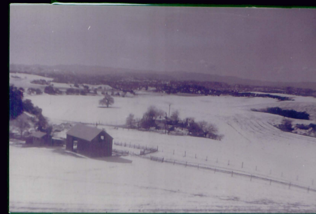
Snow in Argyle in late 1940