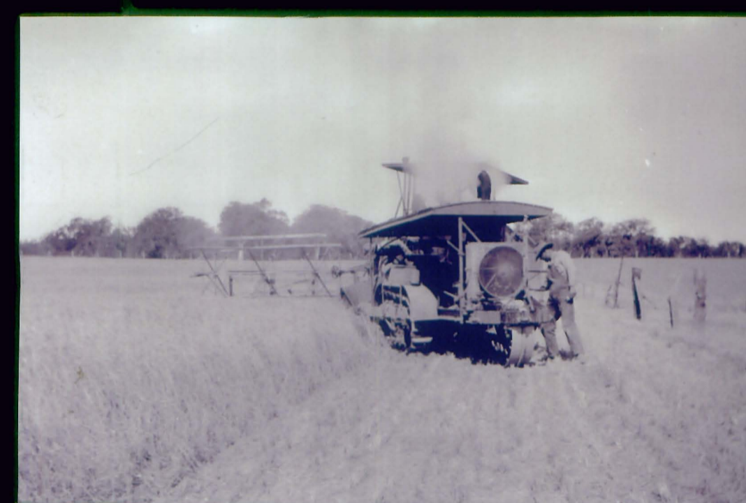
Harvesting in Kirk Canyon