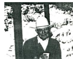
Recognize this Gentleman?